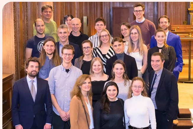
Some future Potentials in Medical Imaging

Look back with us to the beginnings, from initial discussions, first working meetings, the first establishment of nodes, a network structure to the present day with seven nodes and around twohundred MIC members!